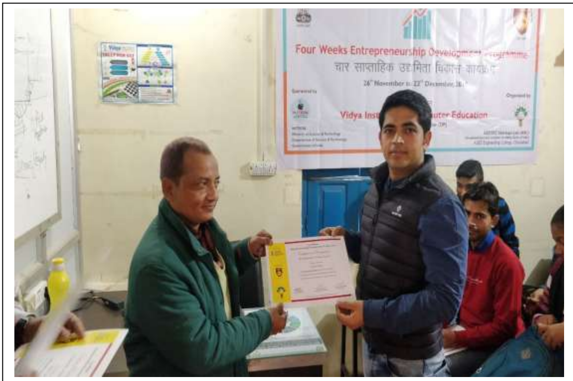
Certificate distribution ceremony