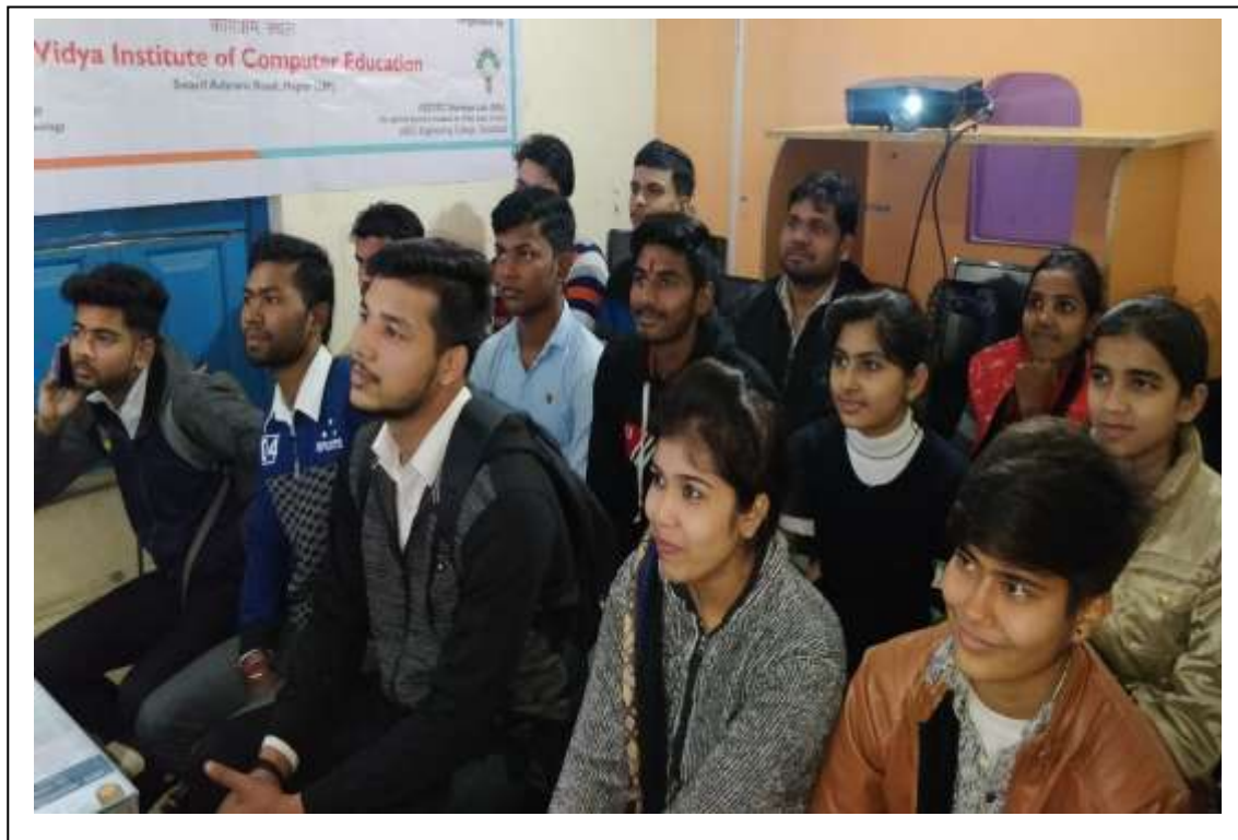
Class room session