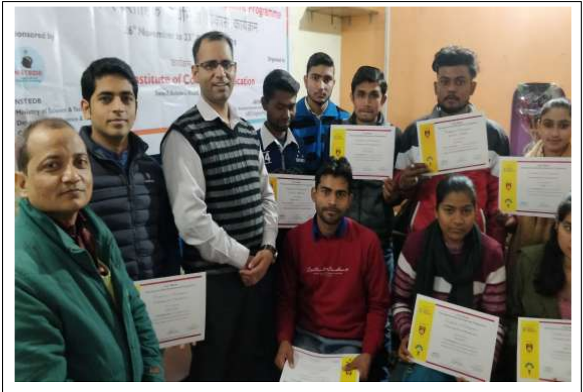
Group photograph of participants