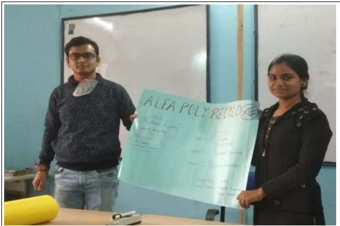
'B' Plan presentation by the participants