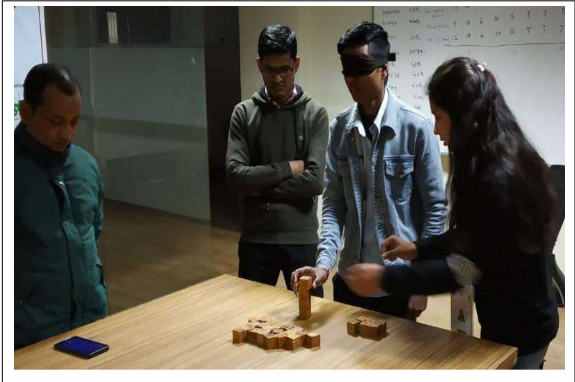
Tower Building Activity