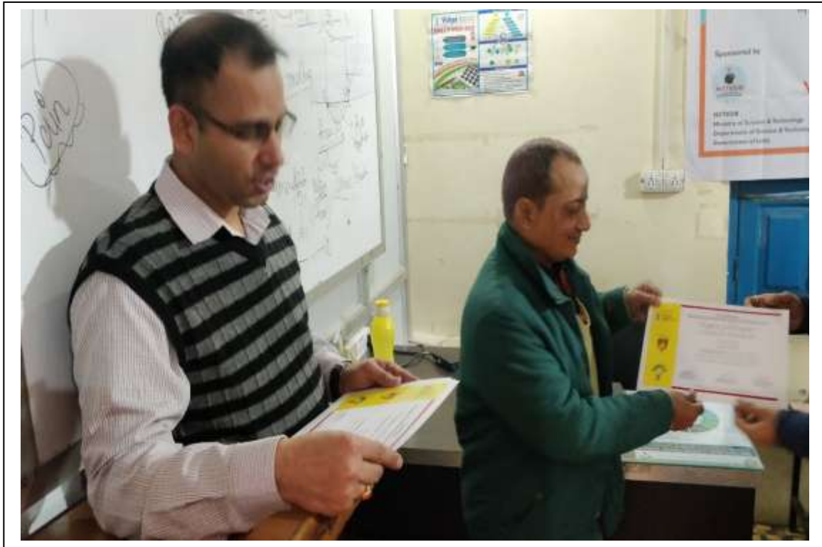
Participants during E-Commerce class